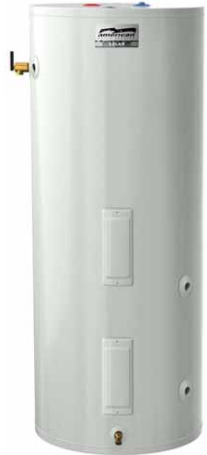
SSX62-80H-045S and SSX62-119H-045S